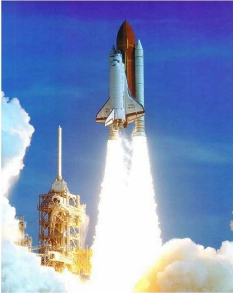
Figure 2. The External Boosters of the US Space Shuttle are made from Weldable Al-alloys

The corrosion behavior of Al alloys is strongly influenced by the chemical composition, which effects their electrochemical potential, and the distribution of the various phases within the microstructure. Structure-dependent forms of corrosion such as intergranular attack, exfoliation and stress corrosion cracking (SCC) were encountered with heat treatable, high strength alloys, preventing exploitation of potential maximum strength of wrought products. New metallurgical processes and compositional modifications resulted in improved corrosion resistance. For copper bearing 7XXX series alloys, exfoliation corrosion and SCC behavior could be significantly improved by duplex aging, however, at the sacrifice of strength. Recently optimized heat treatment procedures have been developed that provide an optimum combination of strength and corrosion characteristics.